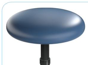
Upholstered / Vinyl Seat Style