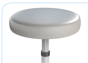
IC+ Seat Style